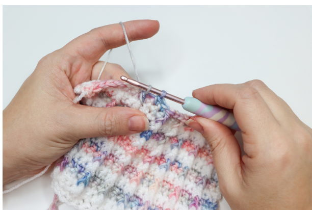
Complete Treble: (Yarn over, pull through two) Twice. [one loop on hook]