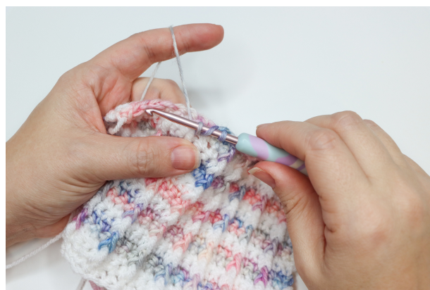
Pull yarn through. [Three loops on hook]