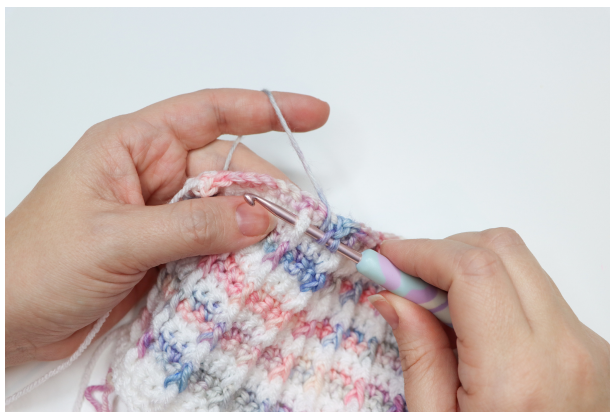
Insert hook around front post treble from two rows below.