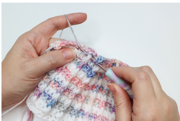
Yarn over. (Yarn around hook)