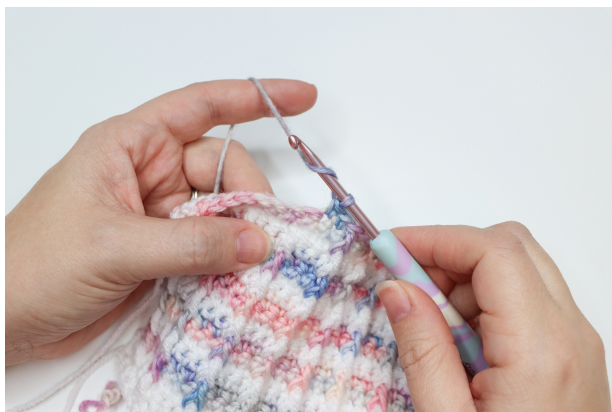
Yarn over. (Yarn around hook)